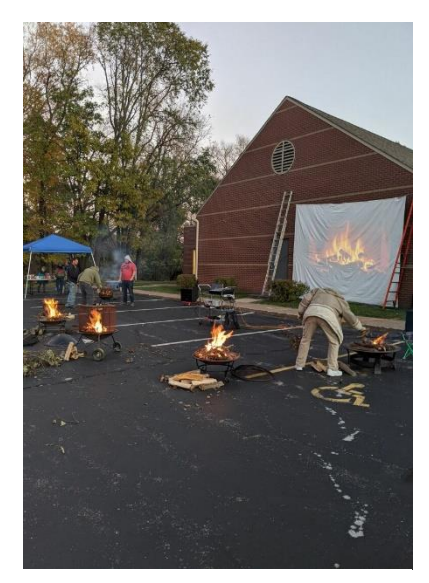
Movie on the big screen in the parking lot.