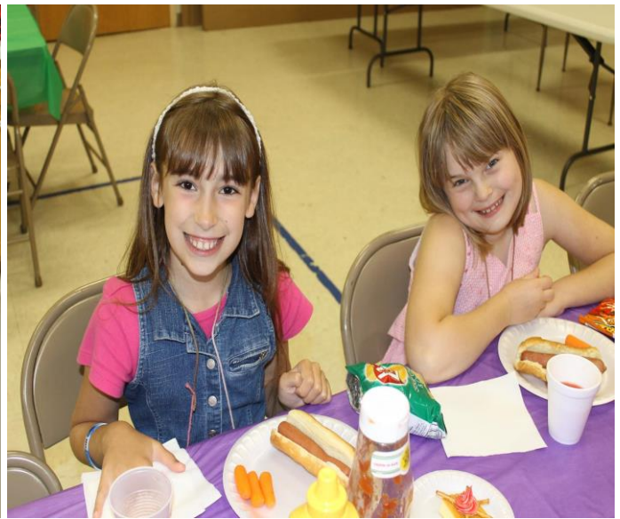
Just some random VBS kitchen pictures (note the campfire brownies – neat)!!